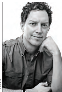
JOHN K. ANDERSON

PATTERNING: Built in 1907, this Stick-style Victorian required a down-to-the-studs remodel to better suit its occupants — a young client with an affinity for fashion, art and design, along with her infant daughter. Within the traditional envelope, JKA reimagined the interiors to integrate modern gestures, yielding a home where different eras and styles beautifully coexist. The standout elements — often bold and edgy (and now a proper reflection of the homeowner) — include chevron flooring with alternating dark and light wood in wide and thin planks; rich jewel tones; black-and-white geometric tiles paired with a burnished steel hood and white Calacatta marble in the kitchen; and a graphic floor pattern combining three types of marble (Calacatta, Marquina, and Emperador) in the primary bath.