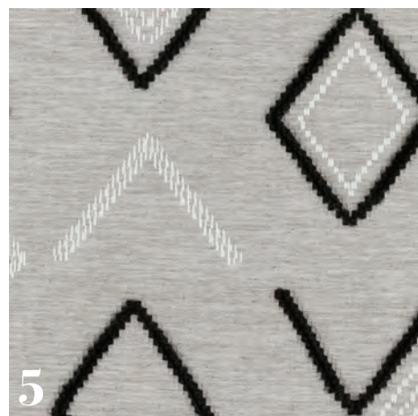
1 Fabricut Montauban fabric in Carbon by Christiane Lemieux fabricut.com 2 Fabricut Montrouge fabric in Ink by Christiane Lemieux fabricut.com 3 Patterson Flynn Sun Pyramid mixed texture silk rug pattersonflynn.com 4 Pollack Trixie fabric in Queen pollackassociates.com 5 Pollack Story Teller fabric in Eclipse pollackassociates.com